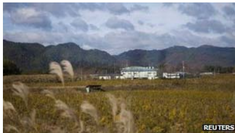
The rice came from an area outside the exclusion zone around Fukushima Daiichi nuclear plant

Last week the Tokyo Metropolitan Government also began testing samples bought at shops in the capital in an attempt to further reassure anxious members of the public.